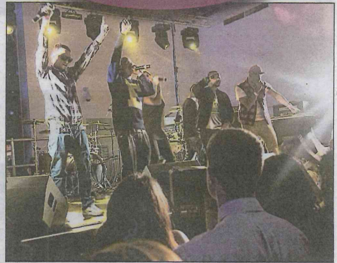
Above: Roll Deep on stage in the Urban Arena Left: Main stage headliner Ellie Goulding

Dubstep favourites Chase & Status later played an early morning DJ set, while Roll Deep and Wretch 32 topped the bill in the Urban Arena.