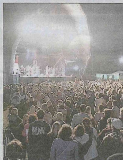
Standon Calling's main stage