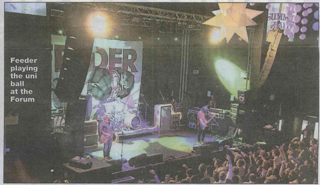
Feeder playing the uni ball at the Forum

Wednesday 15th June 2011. 2pm - 8pm Thursday 16th June 2011. 2pm - 8pm